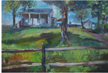
GROB FARM $6900 36 x 24 inches tall, oil on canvas