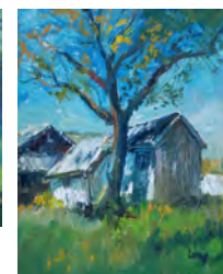
OLD FARM BUILDINGS $640 8 x 10 inches tall, oil on canvas