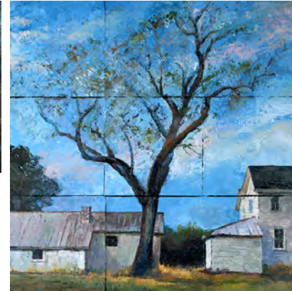
DIVIDED SPACES $5800 29 x 29 inches tall, oil on canvas