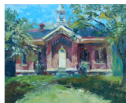
WASHINGTON HEIGHTS SCHOOL $640 10 x 8 inches tall, oil on canvas