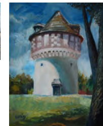
OLD WATER TOWER $1250 11 x 14 inches tall, oil on canvas