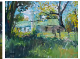
TURNER FARM #1 $640 10 x 8 inches tall, oil on canvas