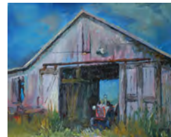
FORGOTTEN TRACTORS $1250 14 x 11 inches tall, oil canvas