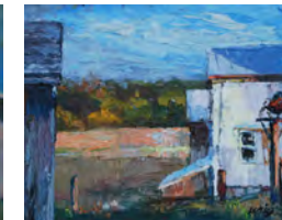
DINNER BELL $720 10 x 8 inches tall, oil canvas