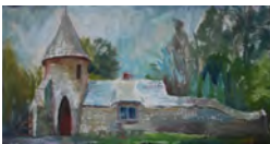
THE GATEKEEPER $1600 20 x 10 inches tall, oil on canvas