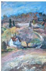
MEYER FARM $1500 11 x 17 inches tall