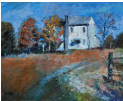
GABBARD FARM $1250 14 x 11 inches tall, oil canvas