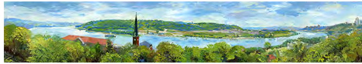
CINCINNATI VIEW OF OHIO RIVER $4800 60 x 10 inches tall, oil on canvas